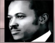
E. Franklin Frazier